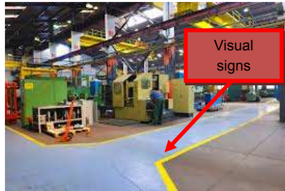
Fig. 2 Visual signs at workplace

The 5S Method also has its place and use in metallurgical enterprises, especially in identifying positions, transportation routes, safety signs in buildings and protection of workers, and marking of the exact location of the individual tools. You can see an example of the visual signs at workplaces in figure 2.